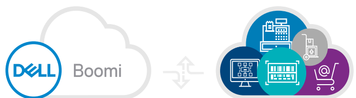
Dell Boomi integrates ERP, Warehousing, POS, Inventory Management, and Ecommerce

Accelerate B2B transactions. Easily manage EDI transactions to securely automate supplier interactions. Gain scale while saving time and money for your company and trading partners. Meet EDI requirements to expand with large online partners like Amazon and eBay.